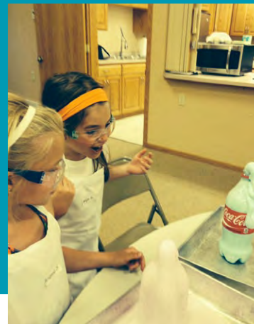
Cavalier Public Library http://bit.ly/1i4wzch