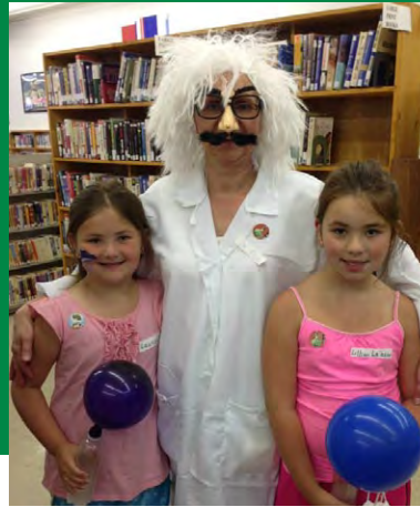
Walhalla Public Library http://bit.ly/1iBKkFj