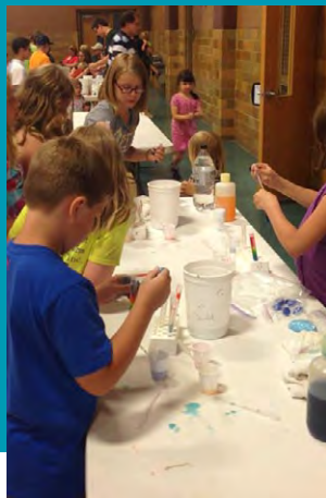
Leach Public Library http://on.fb.me/1nK3kuF