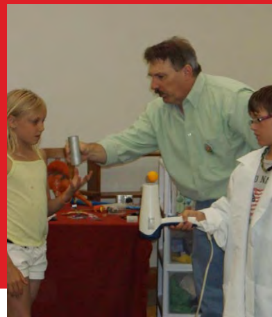
Valley City Barnes County Public Library http://on.fb.me/1lmls9