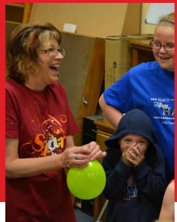
Eddy-New Rockford Library http://on.fb.me/1kY3Y8b