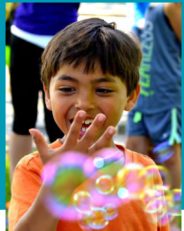
Lakota City Library http://on.fb.me/SNzmuc