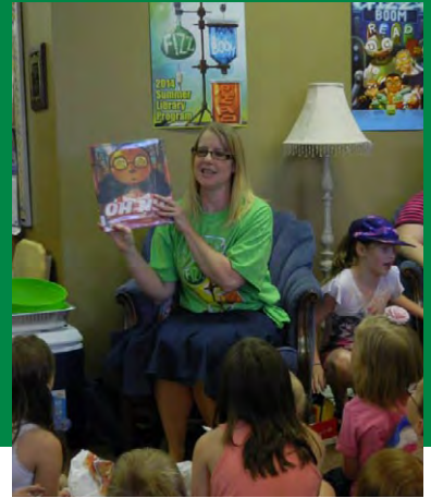
Edna Ralston Library http://on.fb.me/1KY2XwE