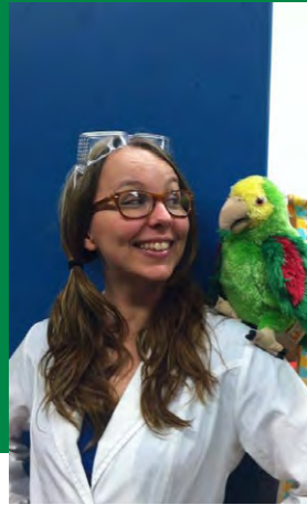
Minot Public Library http://on.fb.me/1y9JLBA