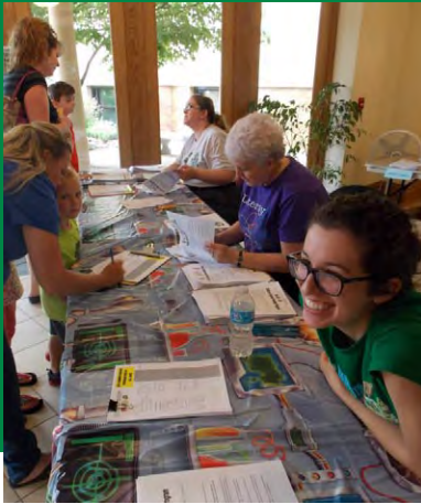
Dickinson Area Public Library http://on.fb.me/1ob5F5h

Summer Reading Kick off snaps from around the state!