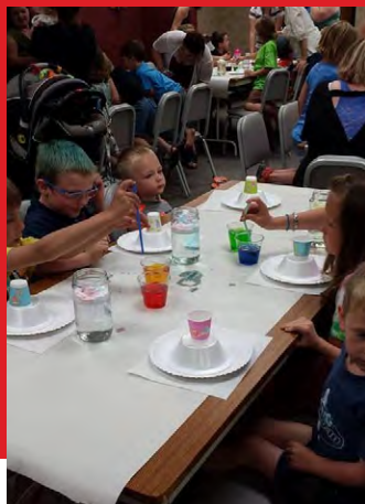
Williston Community Library http://on.fb.me/1pATEWz