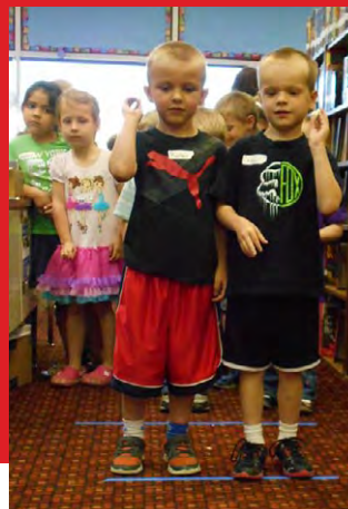
Hankinson Public Library http://on.fb.me/1q4jjEJ