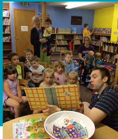
Carnegie Regional Library http://on.fb.me/1lyMG0Q