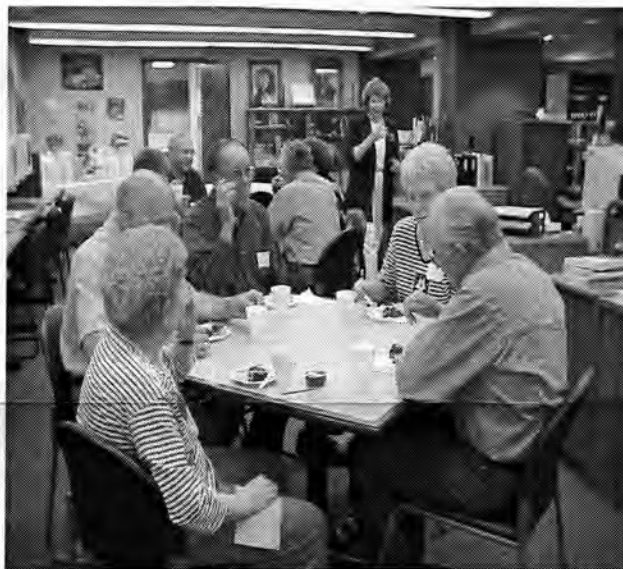
Telephone Pioneers at the reception held in their honor.