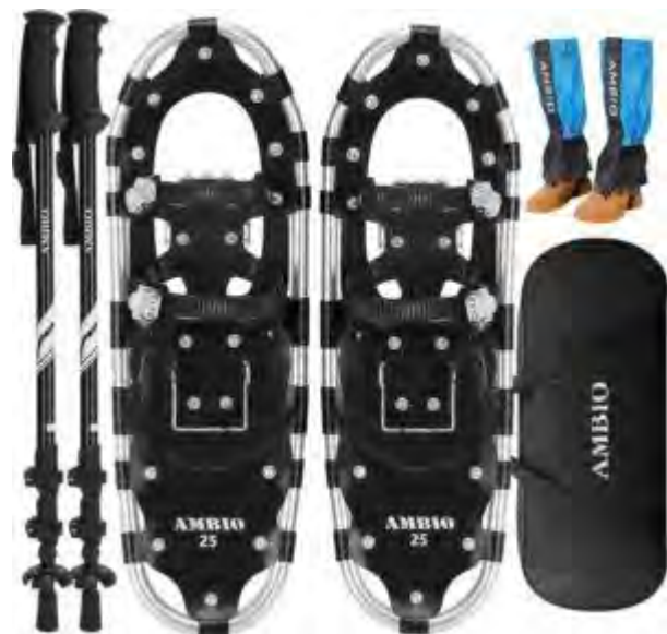
Snowshoes and Skis