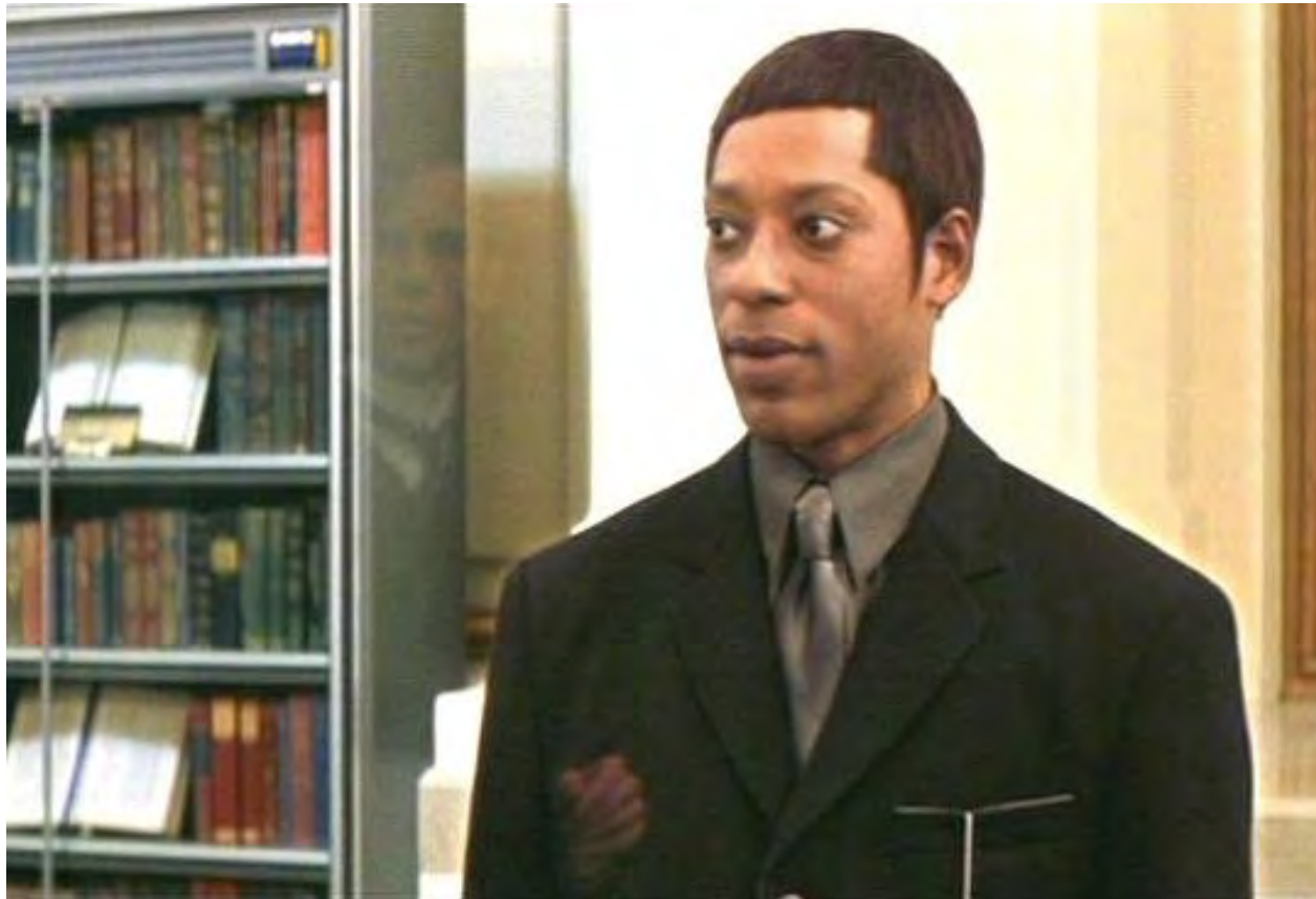
Vox's style in The Time Machine (2002) The Time Machine. Dir. Simon Wells. Perf. Guy Pearce, Samantha Mumba, Jeremy Irons, Sienna Guillory, Orlando Jones. Warner Bros.