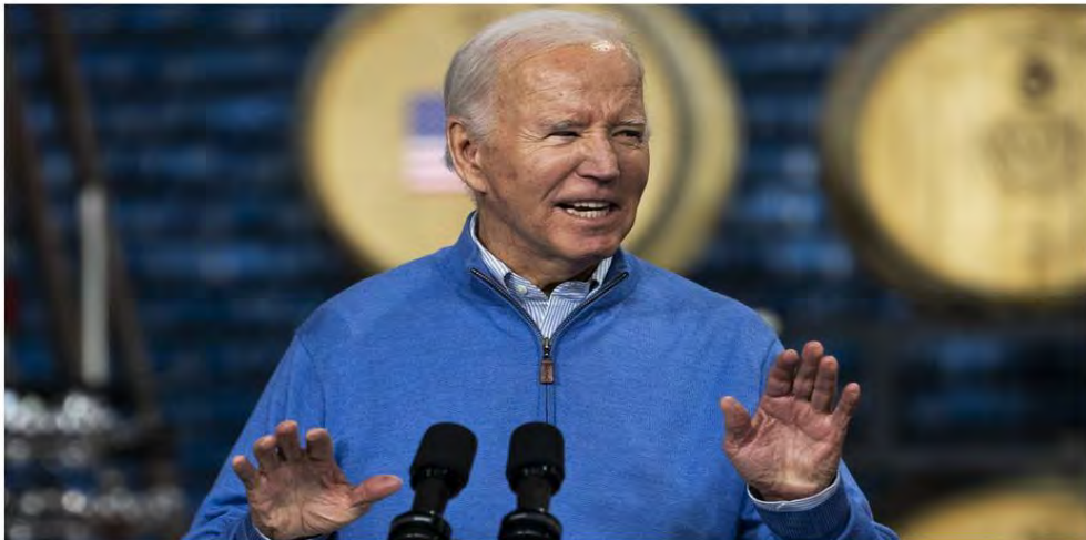
AI startup ElevenLabs suspended the creator of a Biden deepfake that told New Hampshire voters not to vote in their state primary.